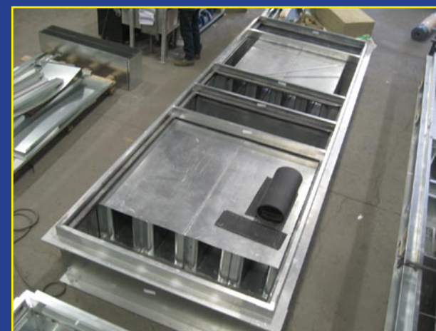
Acoustic Curb Technology for Rooftop Units

E-mail: brd@epix.net • Website: www.brd-nonoise.com