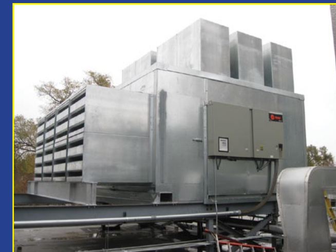
Air and Liquid Cooled Chiller Silencing Systems