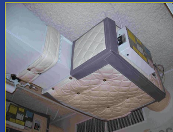
Removable Equipment Sound Jackets, Wraps and Blankets