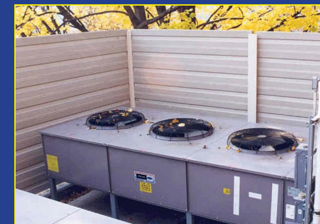
Dry Coolers and Condensers

Specialists in HVAC Acoustics and Vibration Solutions